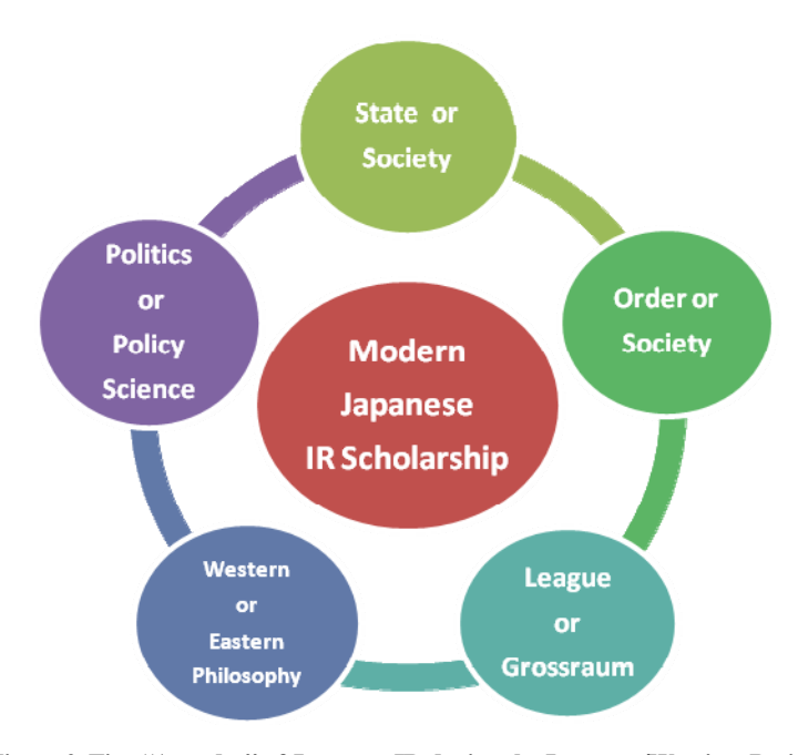
Figure 2. Five "Agendas" of Japanese IR during the Interwar/Wartime Period