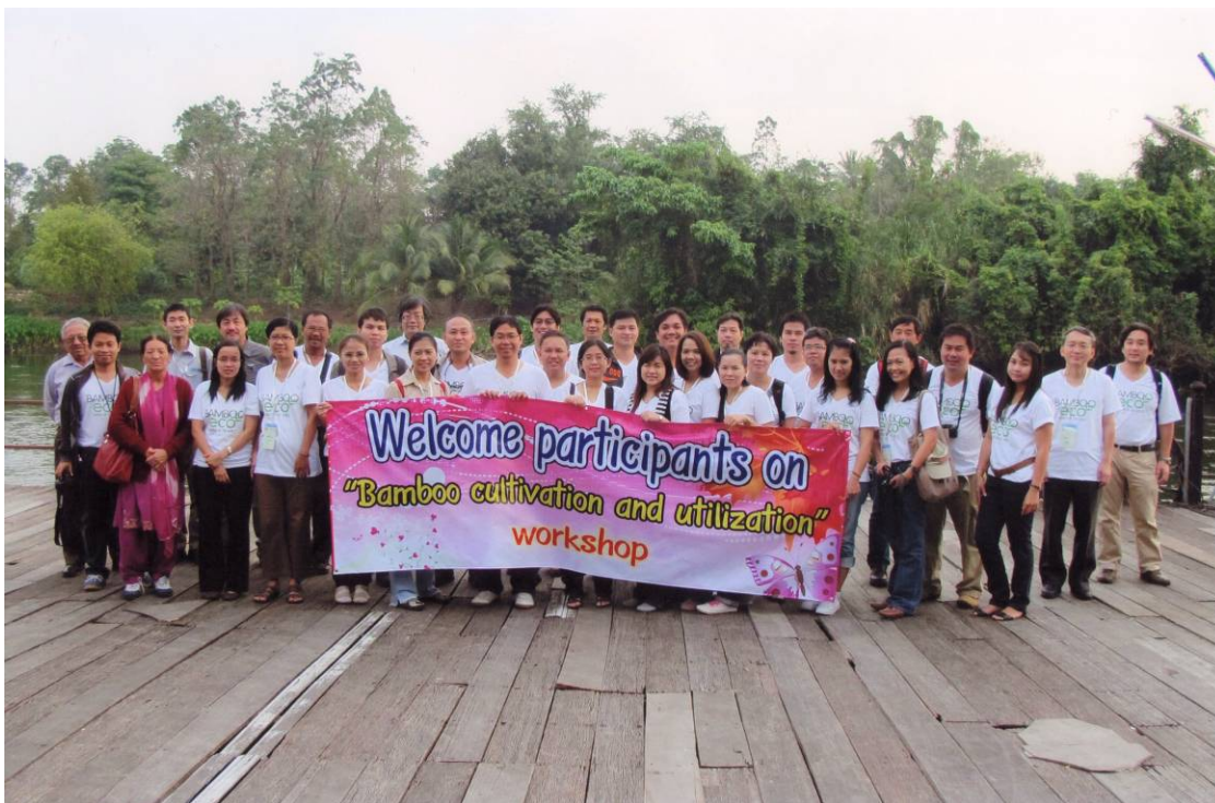
Photo from the excursion tour to Kanchanaburi