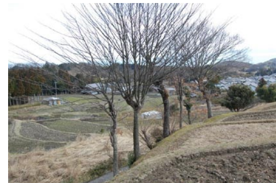
Satoyama at Hourai

持ち物: 汚れても良い服, 歩きやすい靴, 雨具, 飲み物. (必要に応じてフィールドノート, カメラ, 双眼鏡, おやつなど)